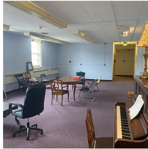
Large Office/Multipurpose Room