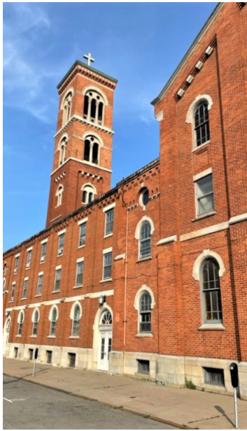
North side Allen St Bldg.