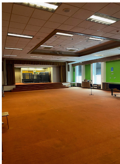
Celebration Hall - About to Be Renovated