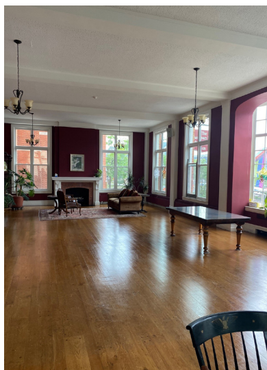
First Floor Gathering Room