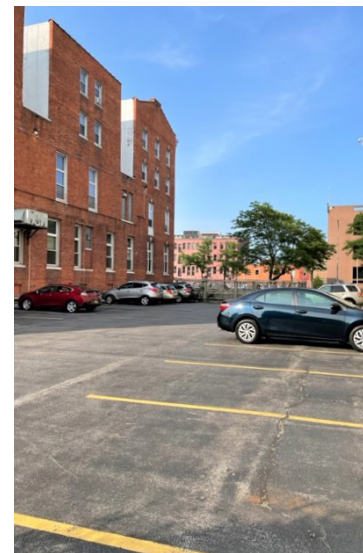
Parking Lot - Side of Building