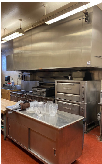
Commercial Kitchen in Celebration Hall