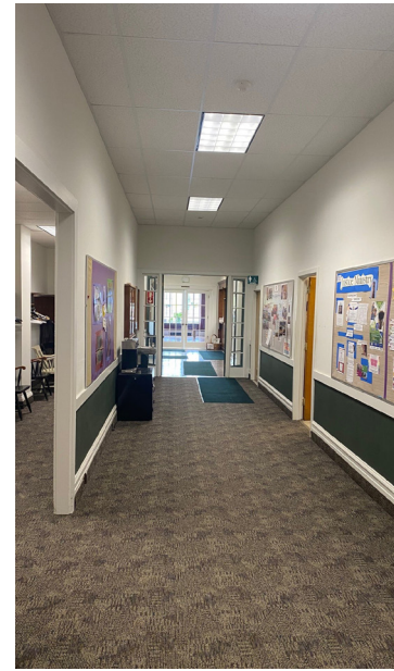
Reception & Main Hallway