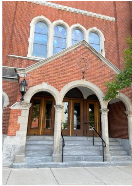
Arched Entry into Sanctuary